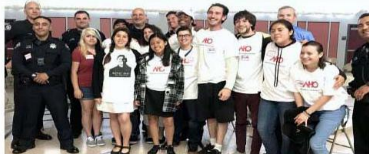
AHO Youth Team Leaders